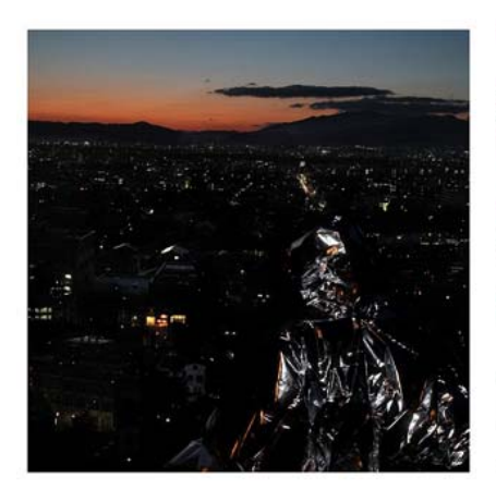
Sascha Weidner, Fragmente II, 2013, Pigmentprint, 70 cm x 70 cm, Courtesy of Entrepreneur 4.0 Award © Sascha Weidner